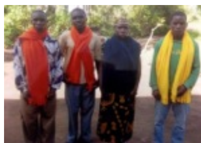
Happy parishioners from St Francis Xavier parish in Tanzania